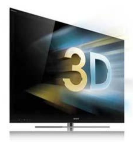
3D in Full HD 1080p

top of Sony's 3D HDTV lineup. Enjoy brilliant Full HD picture quality for both 2D and 3D programming, and a new level of precision and detail with Intelligent Peak LED full-array backlighting with local dimming. Sony's X-Reality PRO video processing delivers optimal color, contrast and sharpness--even with low-resolution web videos. Speaking of web videos, built-in Wi-Fi gives you connected entertainment options galore thanks Sony's BRAVIA Internet Video and Widgets. Or play back your digital video, music, and photo files right over your home network from DLNA certified devices. Whatever your entertainment preference, the XBR-55HX929 will deliver in spades--the best of the best.