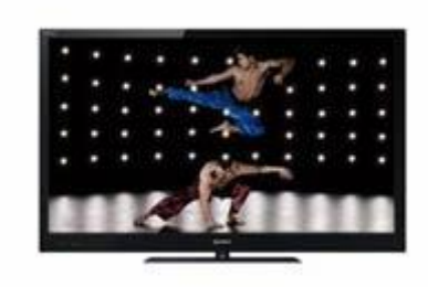
Sony's Motionflow XR 960 technology delivers smooth and precise detail during fast-action scenes.

The HX929 series also features Sony's new OptiContrast panel, which features a design and surface treatment to minimize reflection, producing deeper images with superior black levels even in bright rooms.