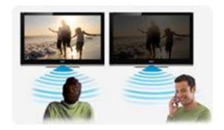
Sony's Intelligent Presence Sensor uses built-in Face Detection technology to turn itself off if no one is watching.

Share your photos on the big screen or listen to your favorite music. Simply connect your digital camera, USB-enabled MP3 player, or USB storage device directly to your HDTV's USB input.